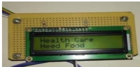
Fig. LCD Display - Need Food

Depending on what the patient requires, the performance will be presented. The accelerometer will sound an alert and indicate that they need food if it is configured to determine angle.