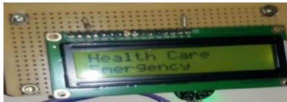
Fig .LCD Display - Emergency

In the event of an emergency or if the patient falls to the ground, the information will be displayed automatically and a continuous warning sound will be generated by a buzzer.