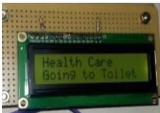
Fig.LCD Display - Going to Toilet

Depending on what the patient requires, the performance will be presented. The accelerometer will sound an alert and indicate that they going to toilet if it is configured to determine angle.