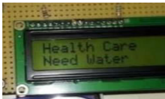
Fig. LCD Display - Need Water

Depending on what the patient requires, the performance will be presented. The accelerometer will sound an alert and indicate that they going to toilet if it is configured to determine angle.